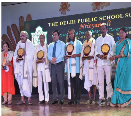
Honouring the Padma Shree Awardees