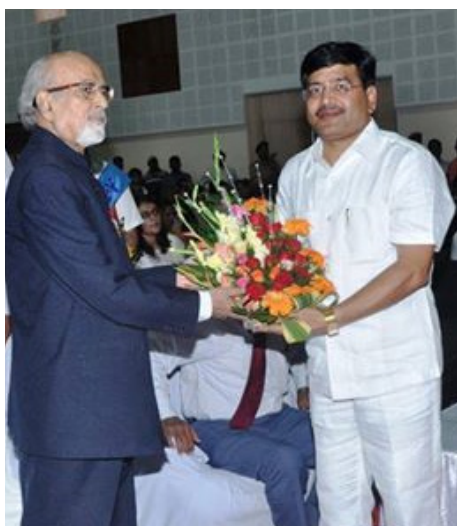
Hon'ble Governor of Jharkhand Late Syed Ahmed recognizing the pioneering feats.