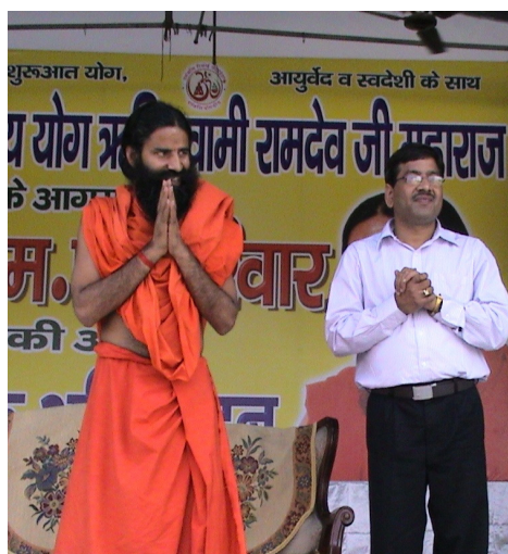
Ingraining value of Yoga in every day life with Baba Ram Dev